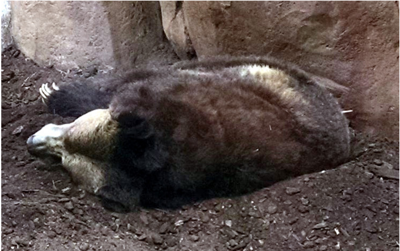
Figure 8: Image of Grizzly Bear