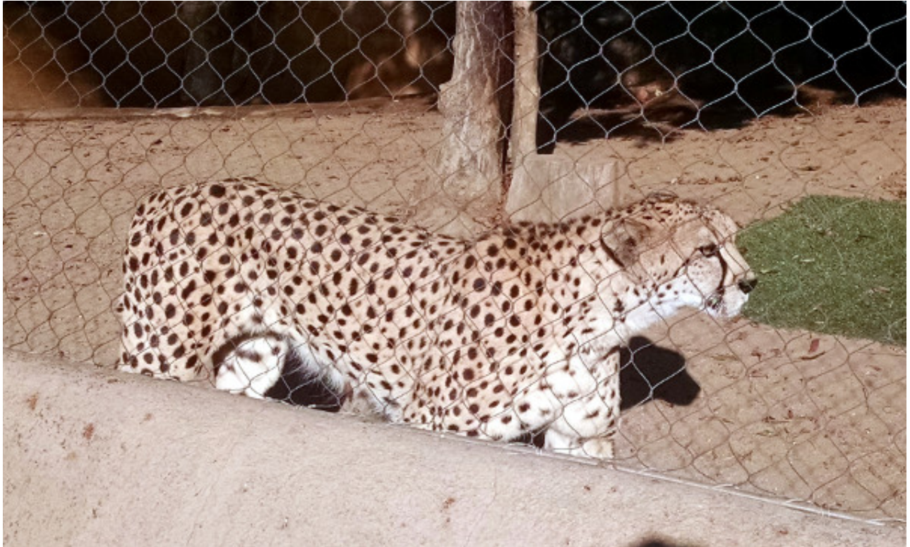
Figure 2: Image of Cheetah