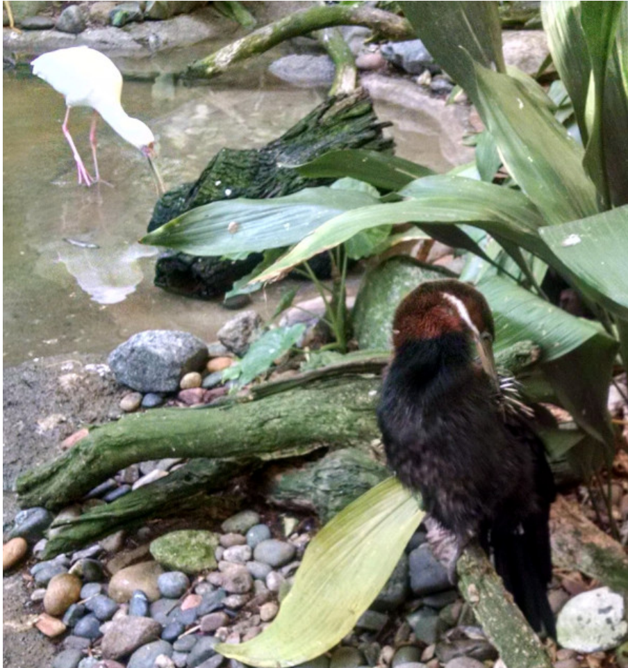
Figure 9: Image of 2 Birds