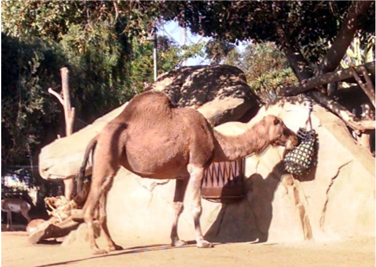
Figure 4: Image of Camel