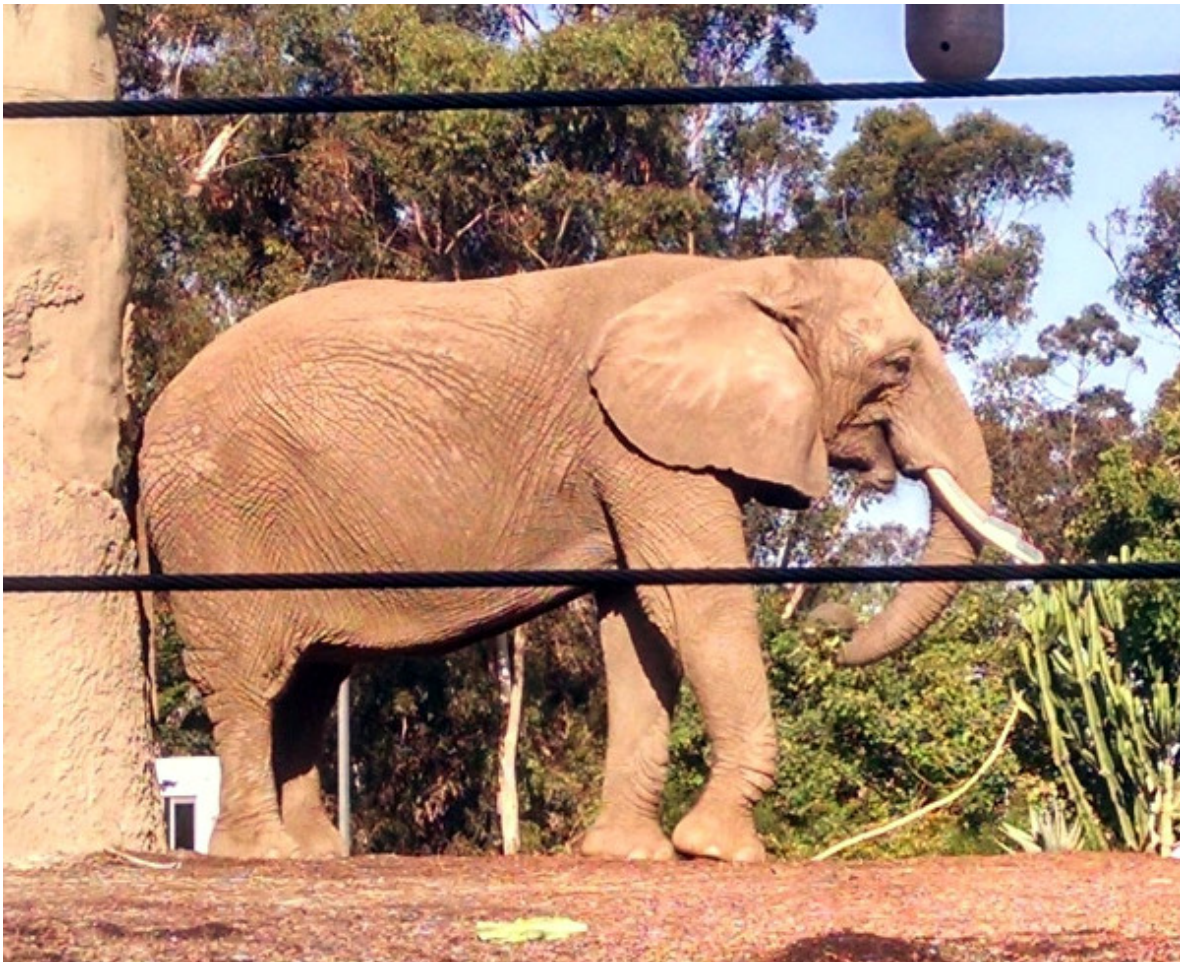
Figure 11: Image of Elephant