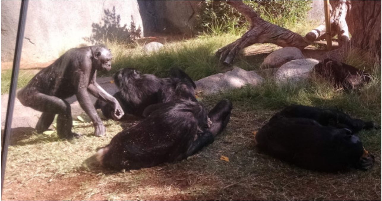
Figure 7: Image of Bonobos