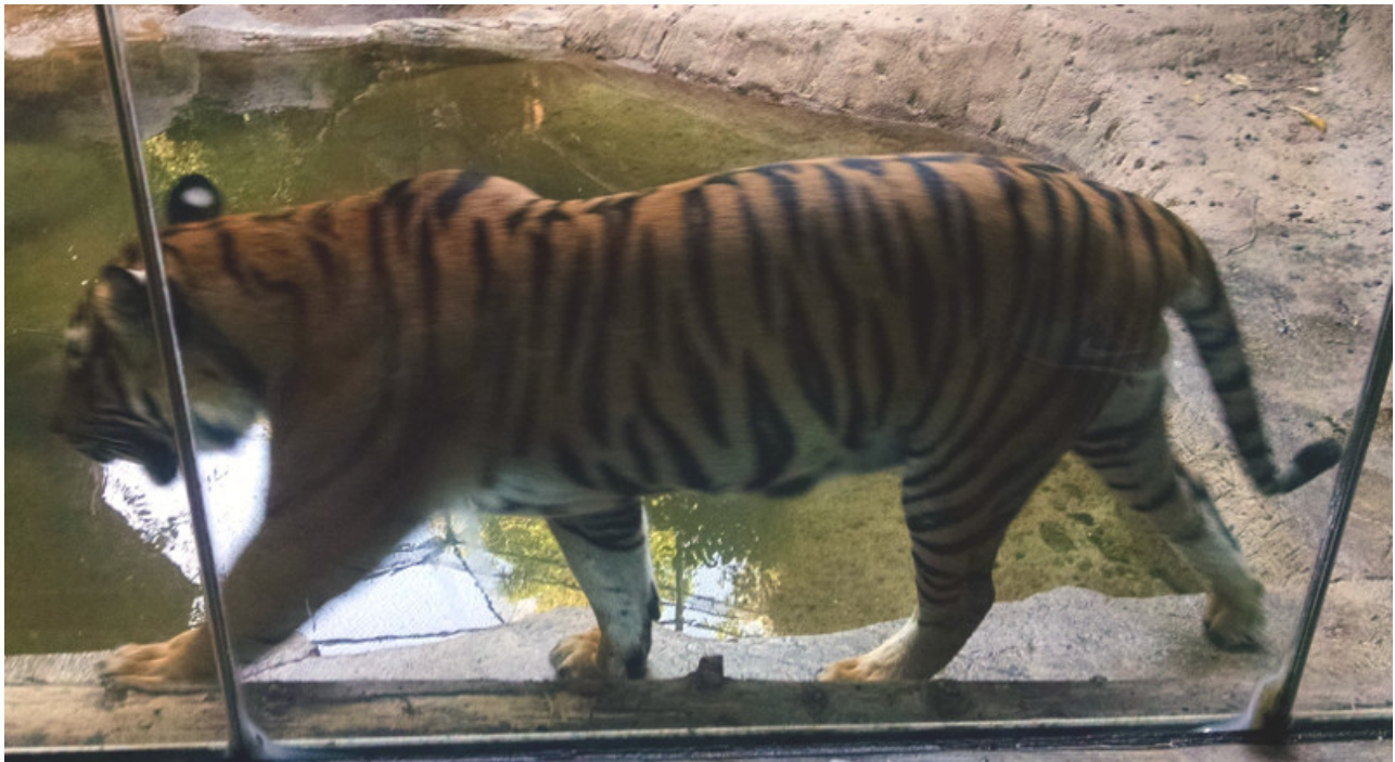
Figure 5: Image of Tiger