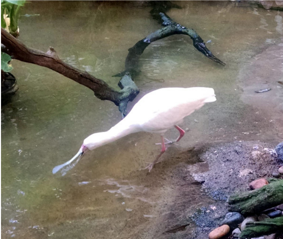
Figure 1: Image of White Bird