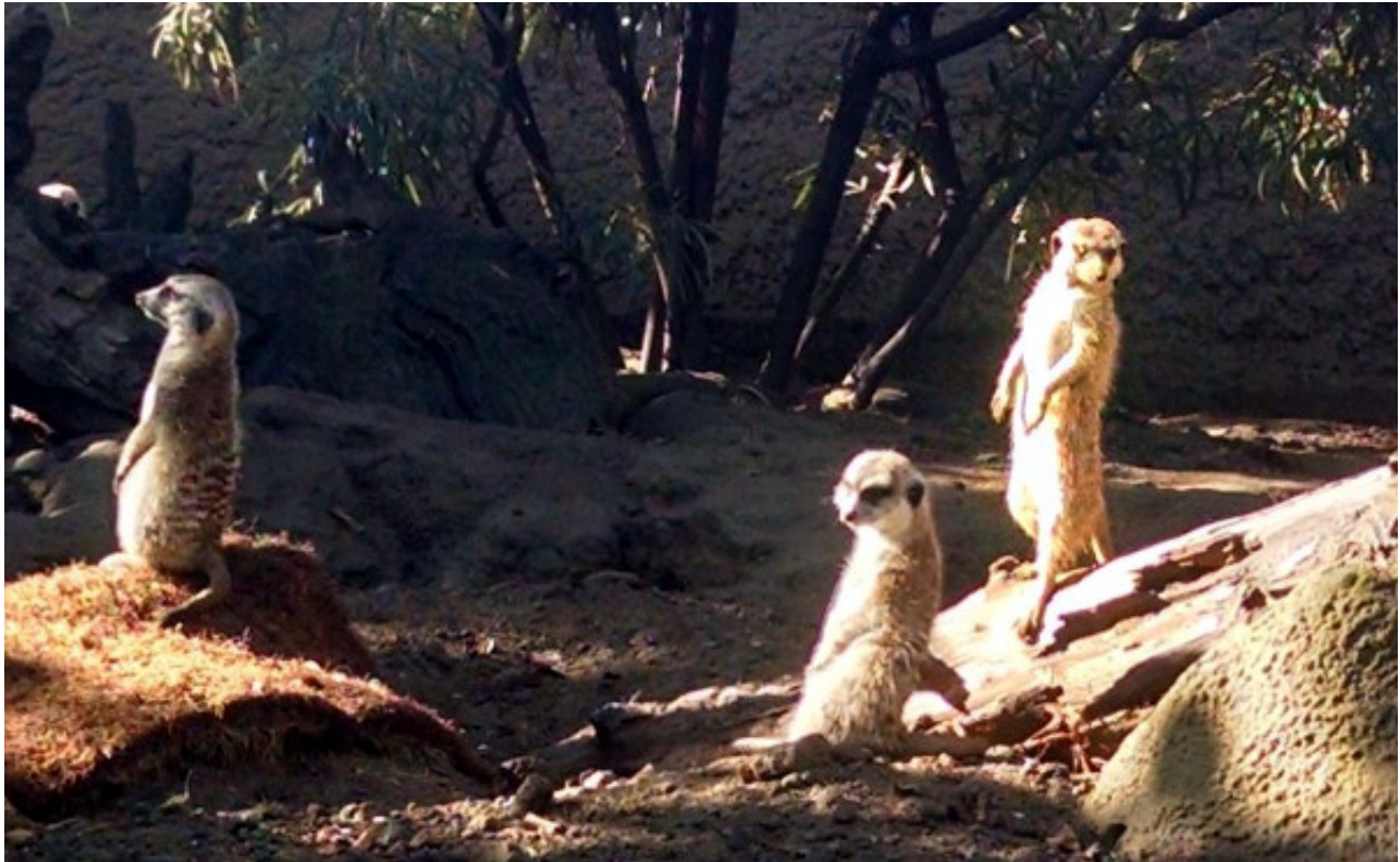
Figure 3: Image of Meerkats