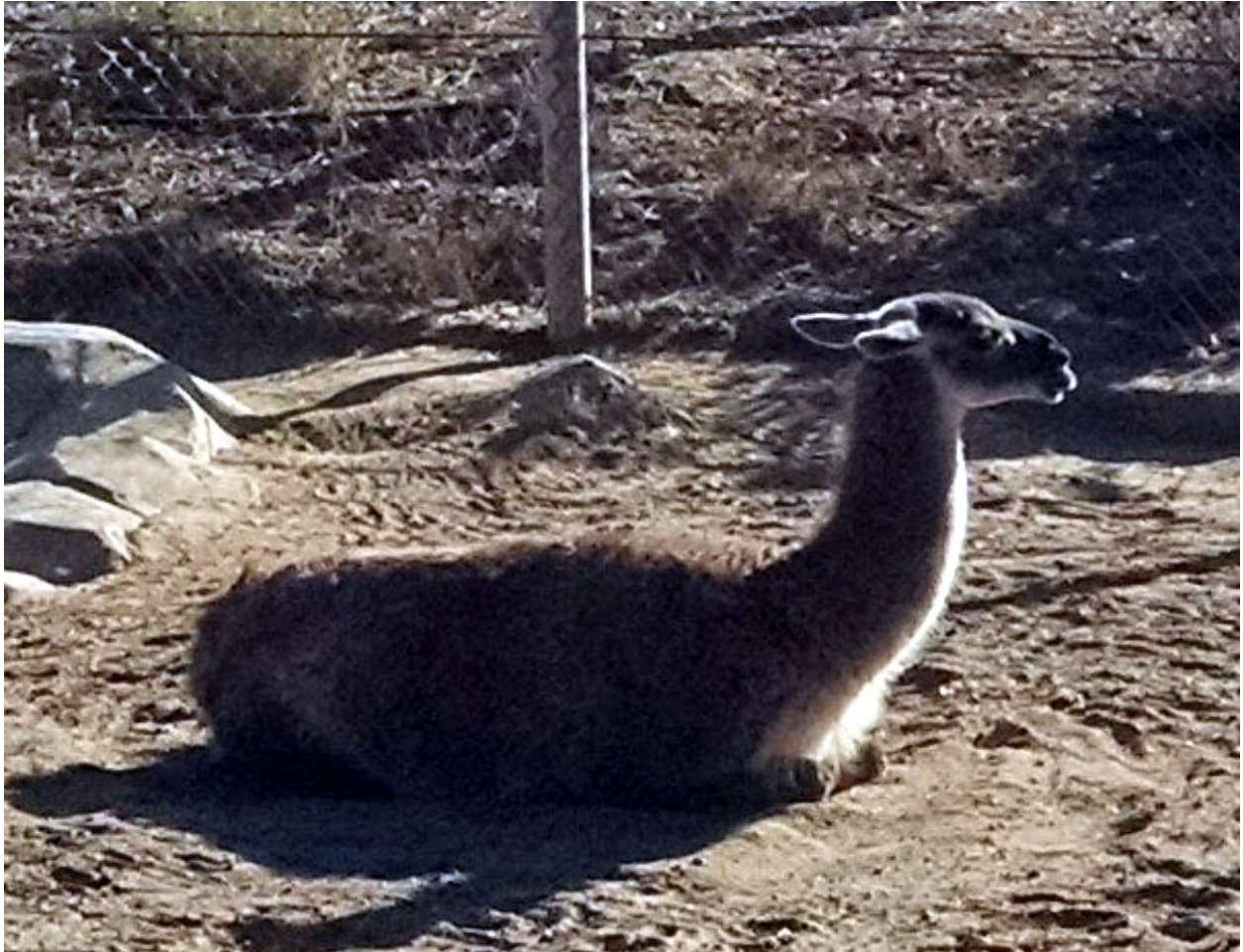
Figure 12: Image of Guanaco