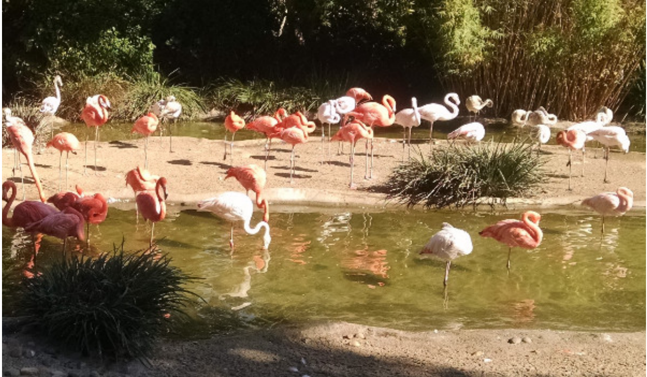
Figure 6: Image of Flamingoes' Gathering