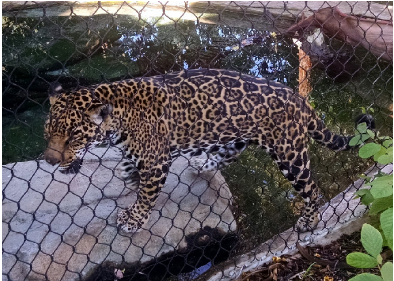
Figure 13: Image of Spotted Leopard