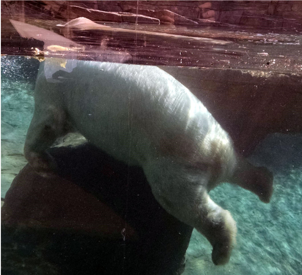
Figure 14: Image of Polar Bear